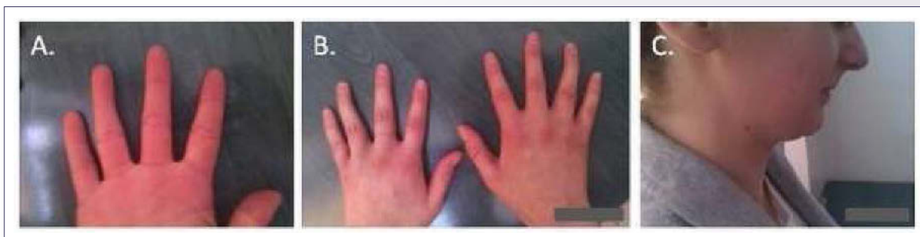
Figure 1. Facial and Skeletal Features Indicative of ATS 11

Reprinted from Krych M, Biernacka EK, Ponińska J, et al. Andersen-Tawil syndrome: Clinical presentation and predictors of symptomatic arrhythmias - Possible role of polymorphisms K897T in KCNH2 and H558R in SCN5A gene. J Cardiol . 2017 Nov;70(5):504-510, with permission from Elsevier.